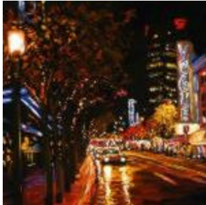
Granville from the west last February.